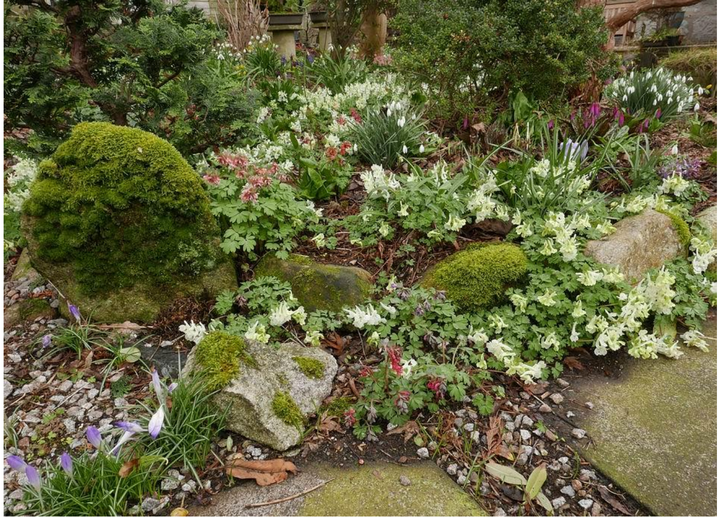
The warmer bright colours of Corydalis solida are joining in with Corydalis malkenis adding to the colour spectacular across many beds - I cannot understand why these plants are not more widely grown.

The white wave effect of the Galanthus and Leucojum that rolled out across the garden will start to fade but is replaced by the creamy white froth of Corydalis malkensis flowers spreading across many of the beds. It flowers and sets seeds every year and I welcome this gradual spread. Like most similar Corydalis the growths disappears as quickly as it arrives and will be back underground by the middle of May.