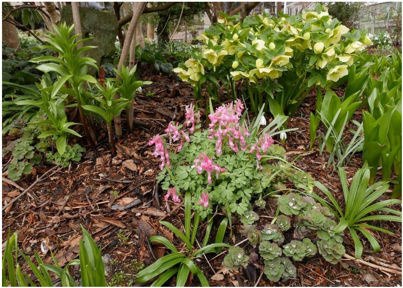
Fritillaria imperalis and Colchicum leaves with Helleborus and Corydalis soilda flowering.

I am never happier than when the ground disappears under the growth of foliage and flowers in the spring and does not come back into view until autumn. This cycle of flowering repeats itself every year but our intermittent weather affects the growth rates of plants differently so the sequence of plants flowering together varies from year to year.