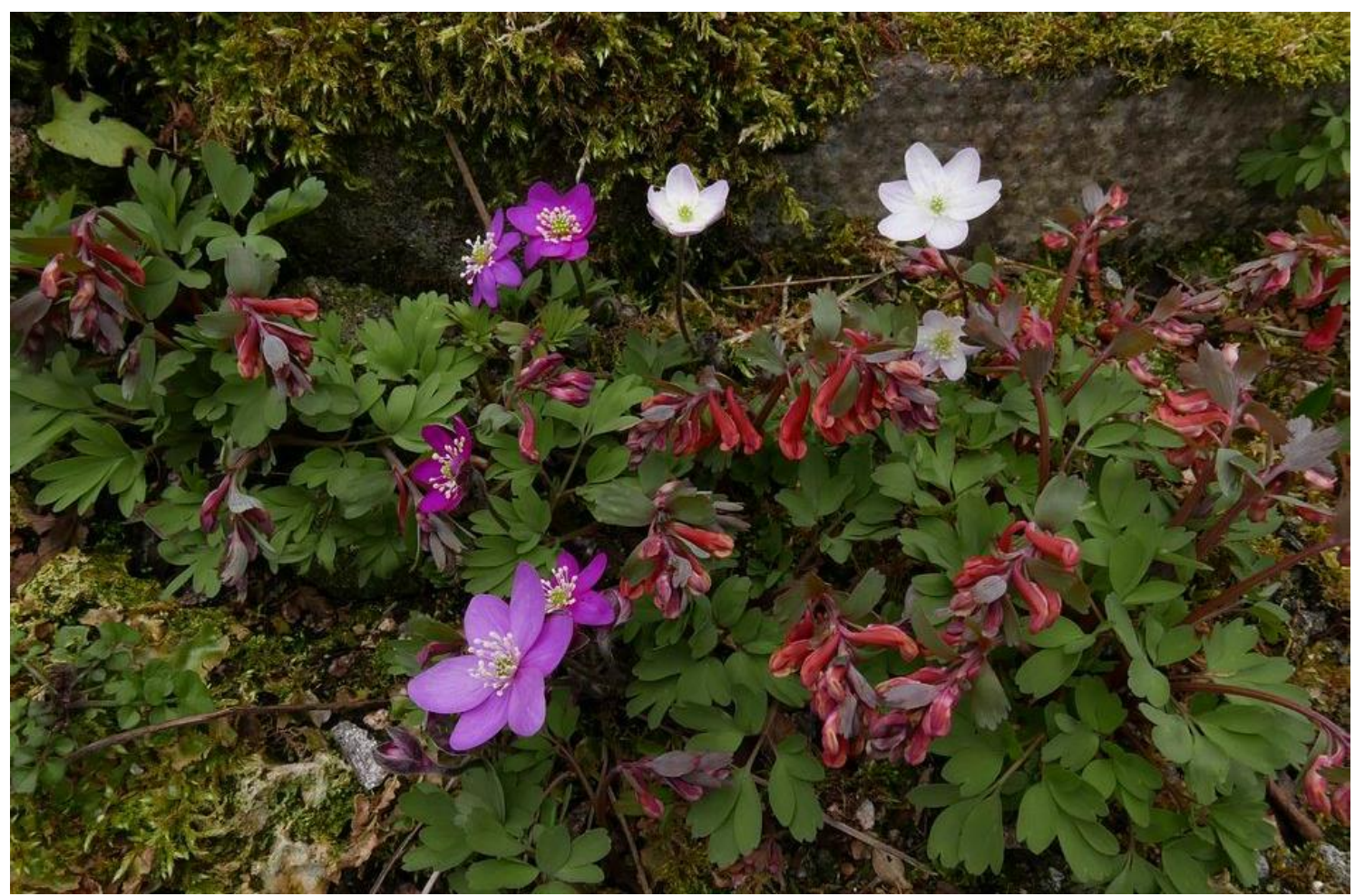
Hepatica nobilis and Corydalis solida