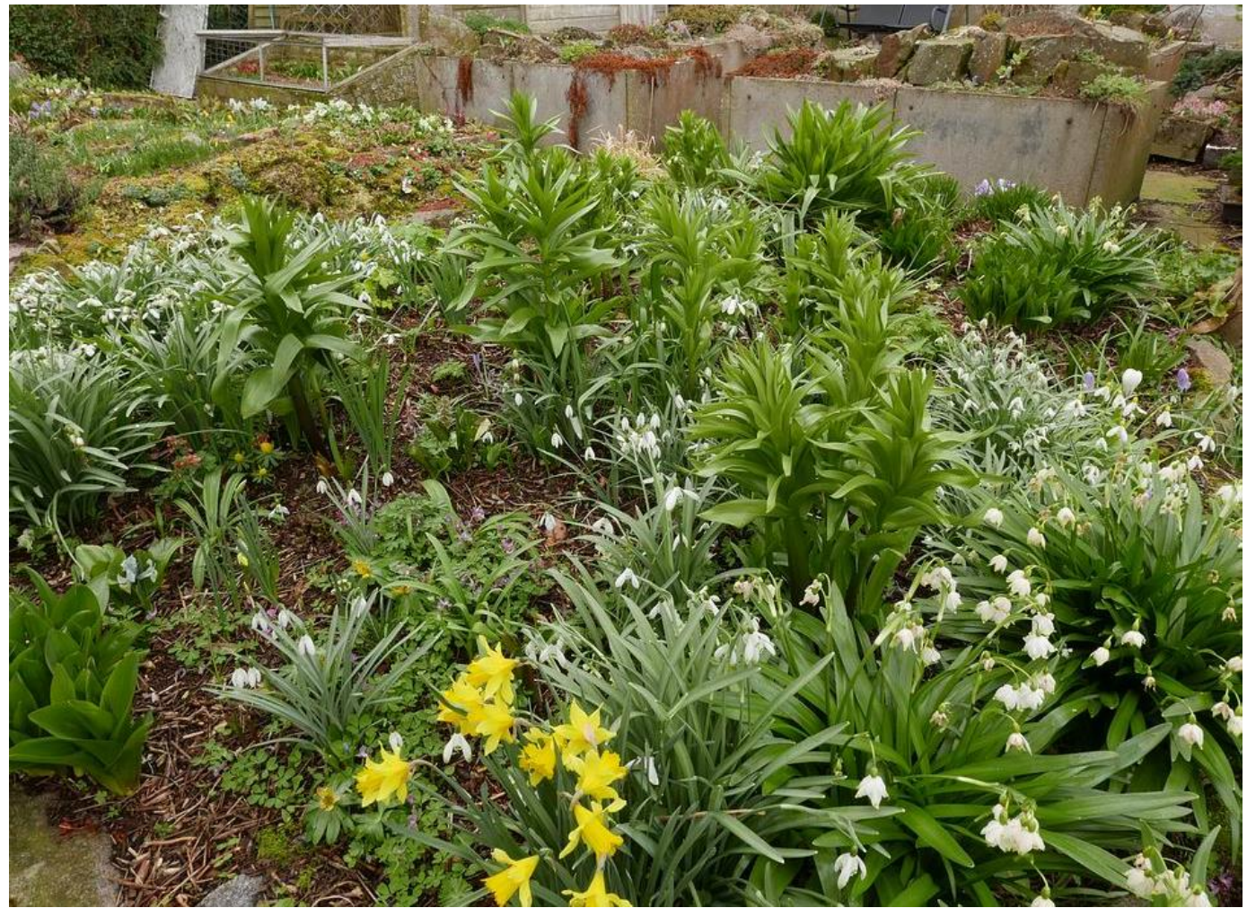
We have been enjoying Narcissus flowers all winter in the bulb houses and now they are appearing in the garden.