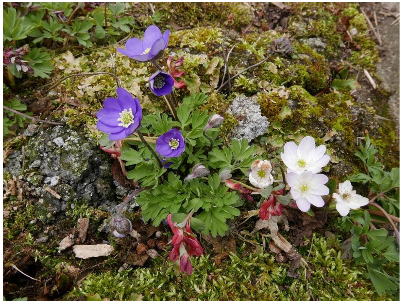
My small bed along the edge of one of the Erythronium frames, landscaped with broken concrete and planted up with Hepatica nobilis and Corydalis solida seedlings, continues to give me great pleasure at this time of year.