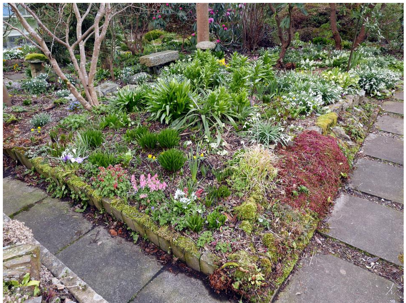
The growth in the Bulb Bed is becoming more lush with the Fritillaria imperallis stems pushing upwards and a number of these are going to flower.