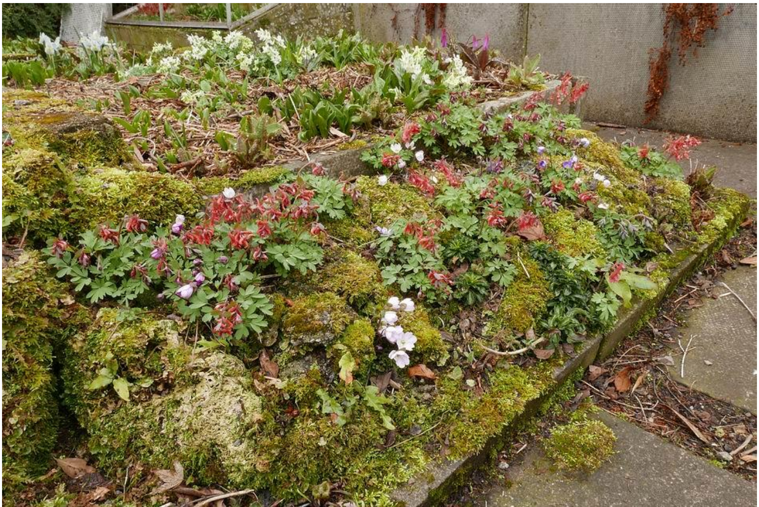
The mini landscape of broken concrete block is now completely covered in moss but I have no intention of removing it this year – I will observe the evolution of this habitat and how the plants respond.