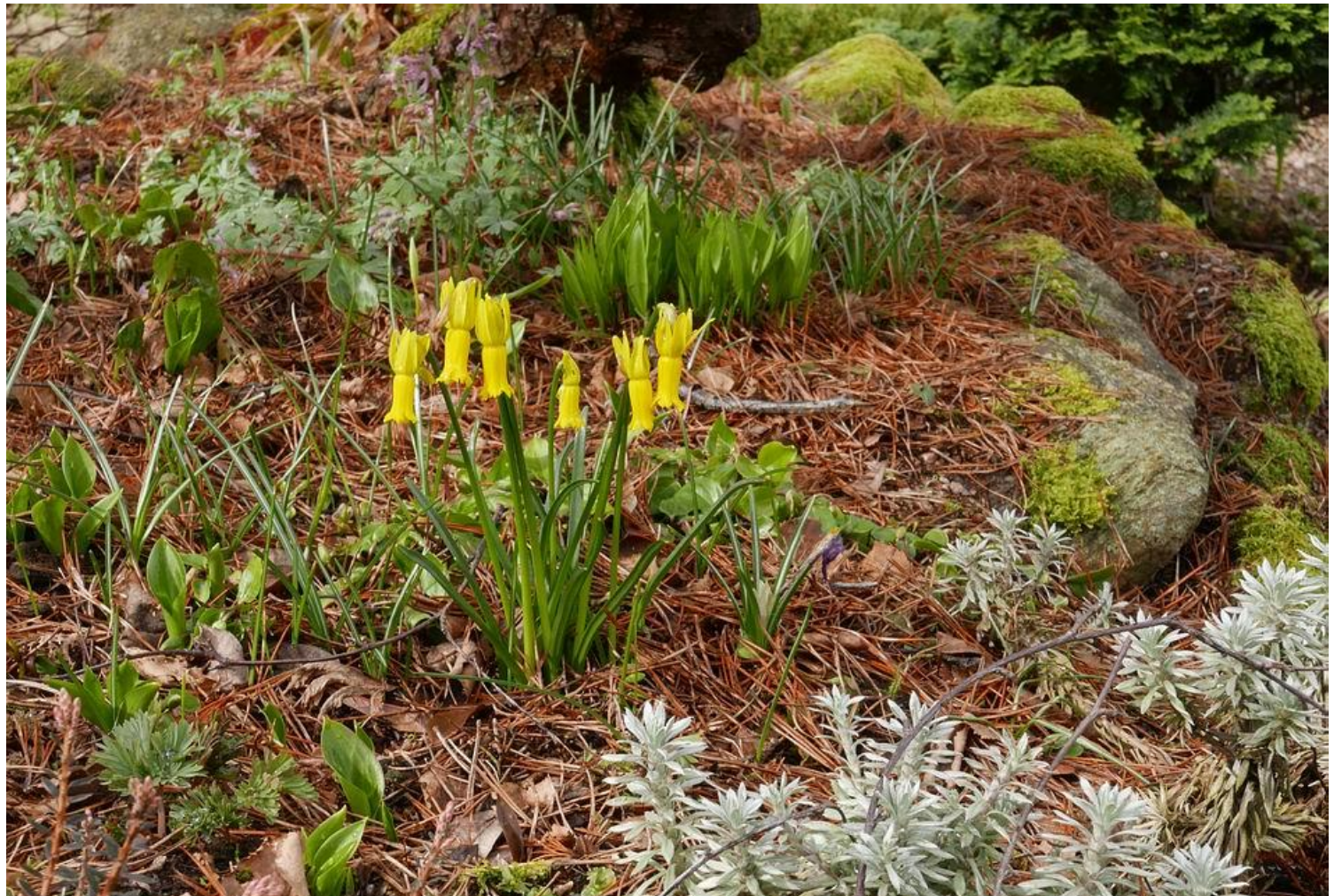
Because of their diminutive stature I tend to establish Narcissus cyclamineus on the raised beds and walls where we can better enjoy their unique beauty. These will soon be joined by a host of other plants including some of the smaller Erythronium and Trillium species.