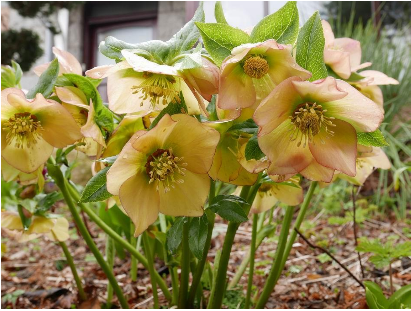
In other parts of the garden Hellebores show no signs of damage.