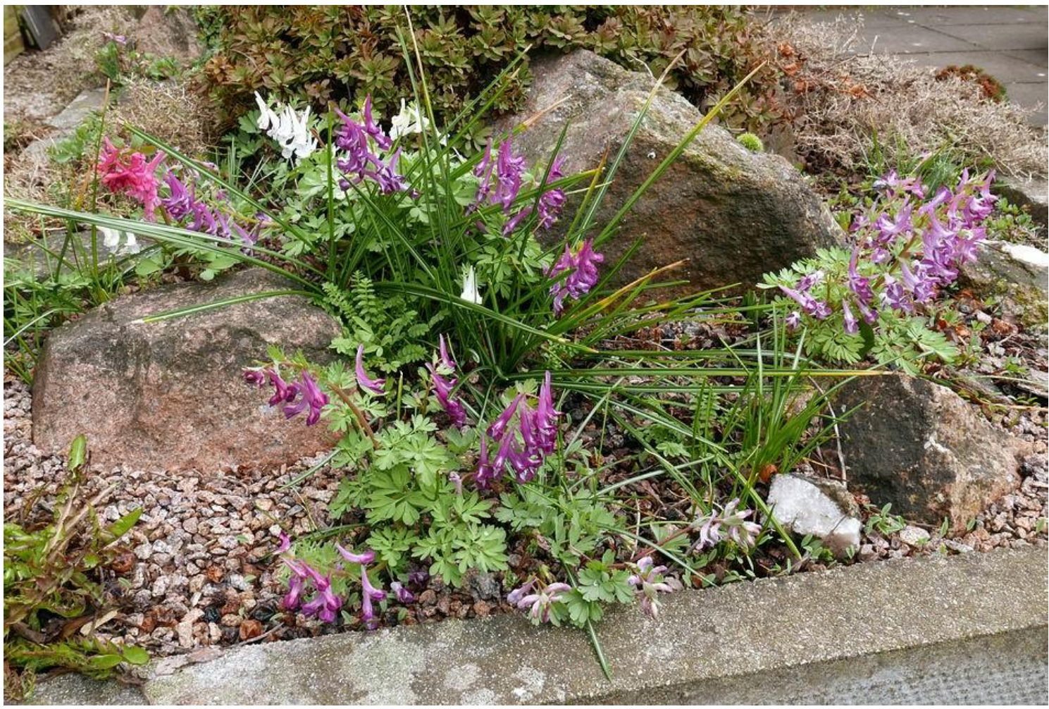
This small self-seeding colony of Corydalis solida incisa is in one of the raised slab beds.