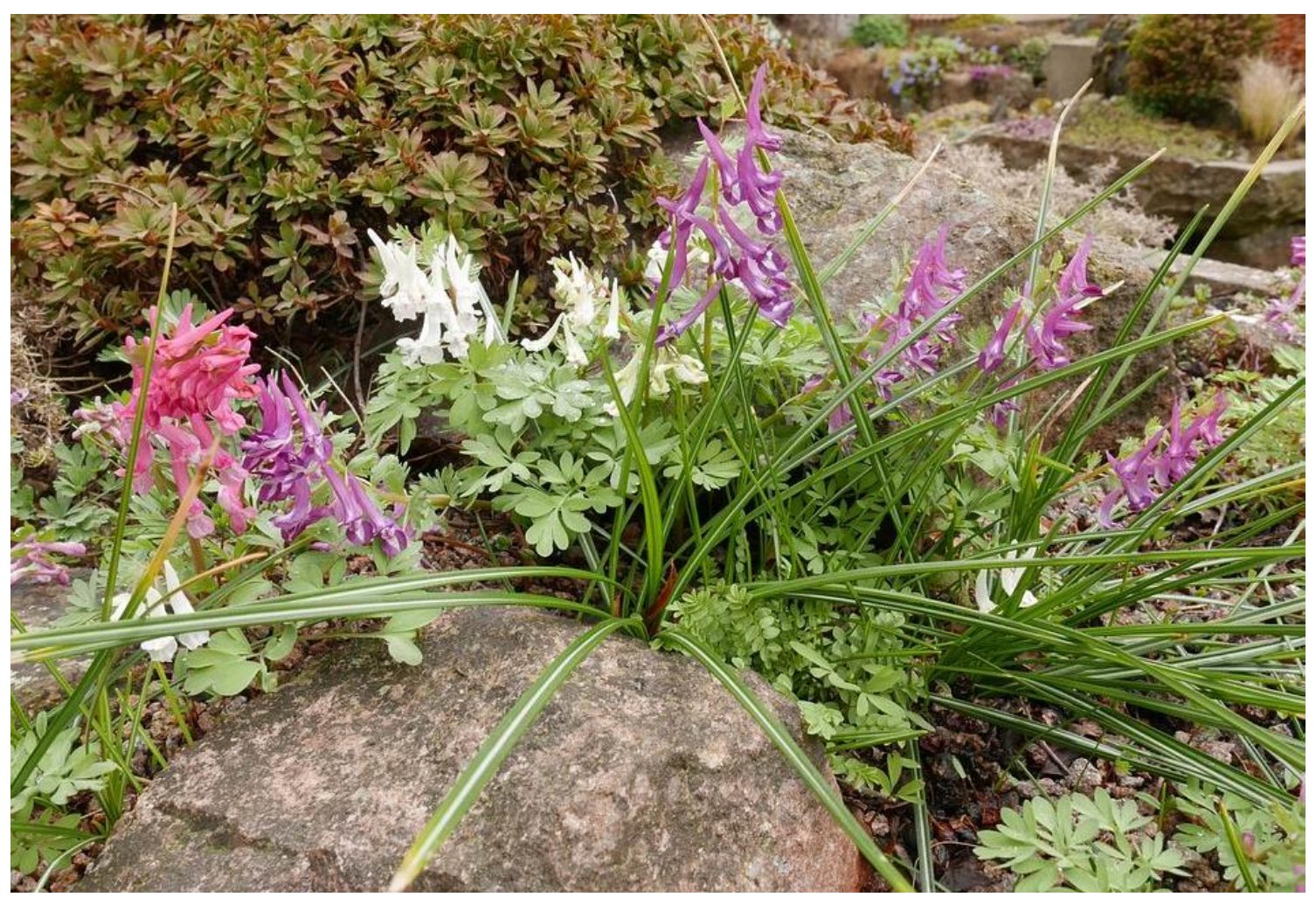
Corydalis solida incisa