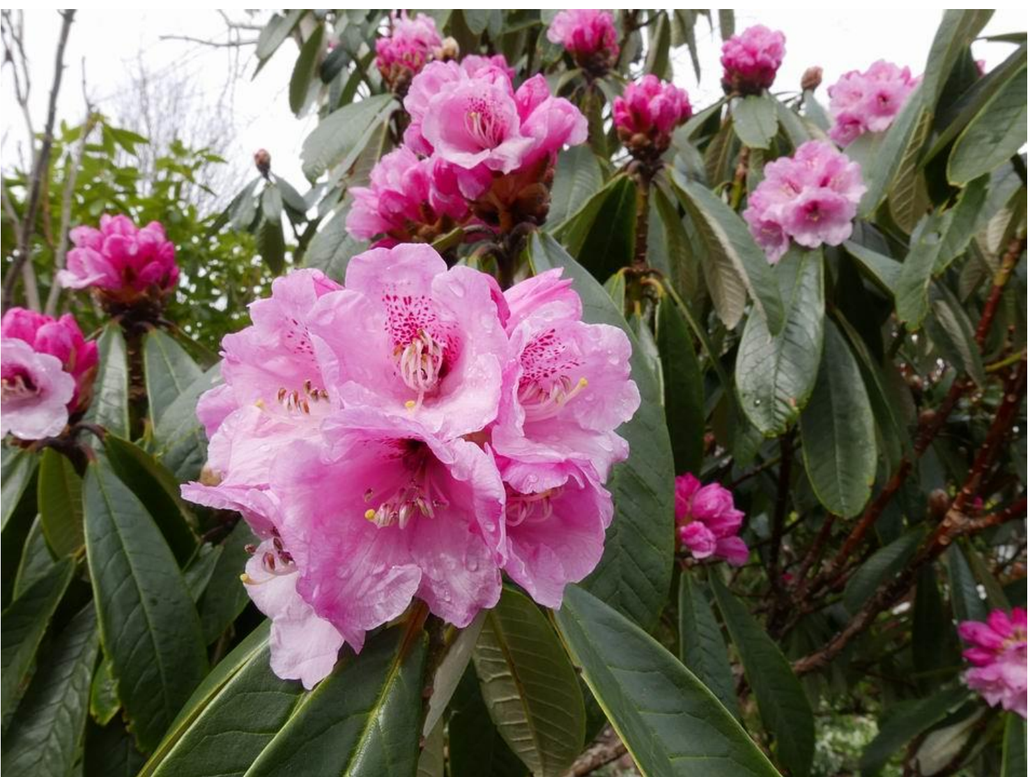
Rhododendron uvariifolium is one of many we have raised from wild collected seeds.

Rhododendrons are a critical part of the structure of our garden, especially the larger ones which are now like small trees providing valuable height. I keep the ground below open by removing the lower branches which allows me to plant bulbs and herbaceous plants right up to the trunk.