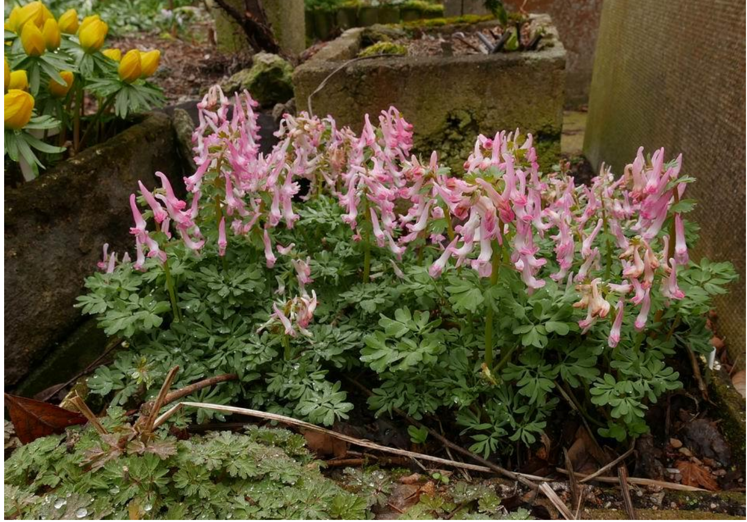
One of my original stock boxes of Corydalis solida 'Beth Evans' which is also planted around the garden.