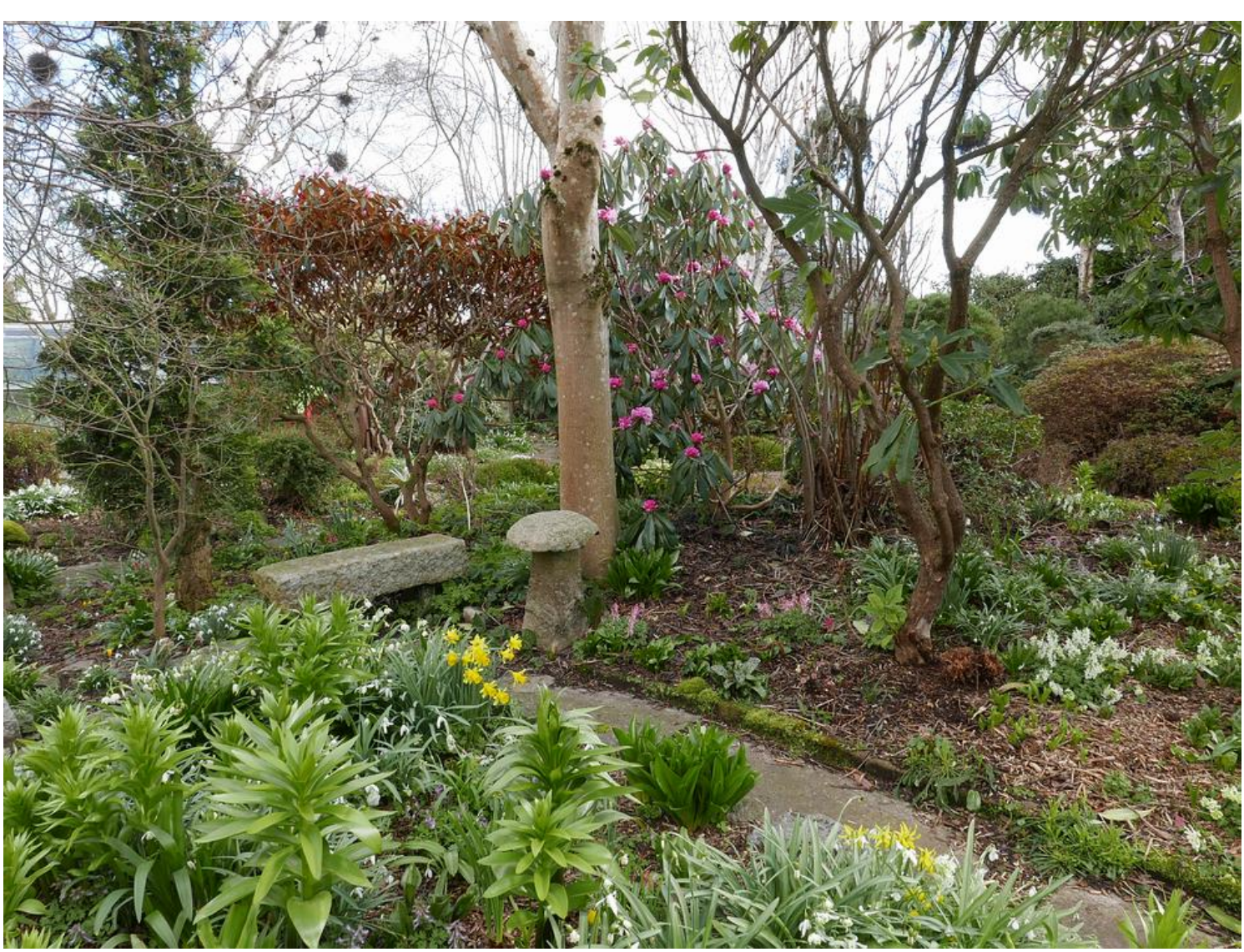
Viewed from the reverse angle Rhododendron uvariifolium seems less dominant.