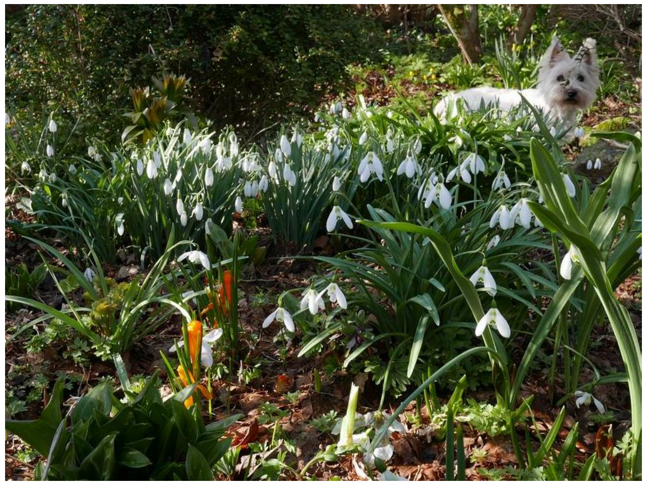
Galanthus and Megan

In many warmer gardens the snowdrop season is almost over but here in the colder north many of our Galanthus are still in glorious condition and depending on our temperatures will continue for some weeks.