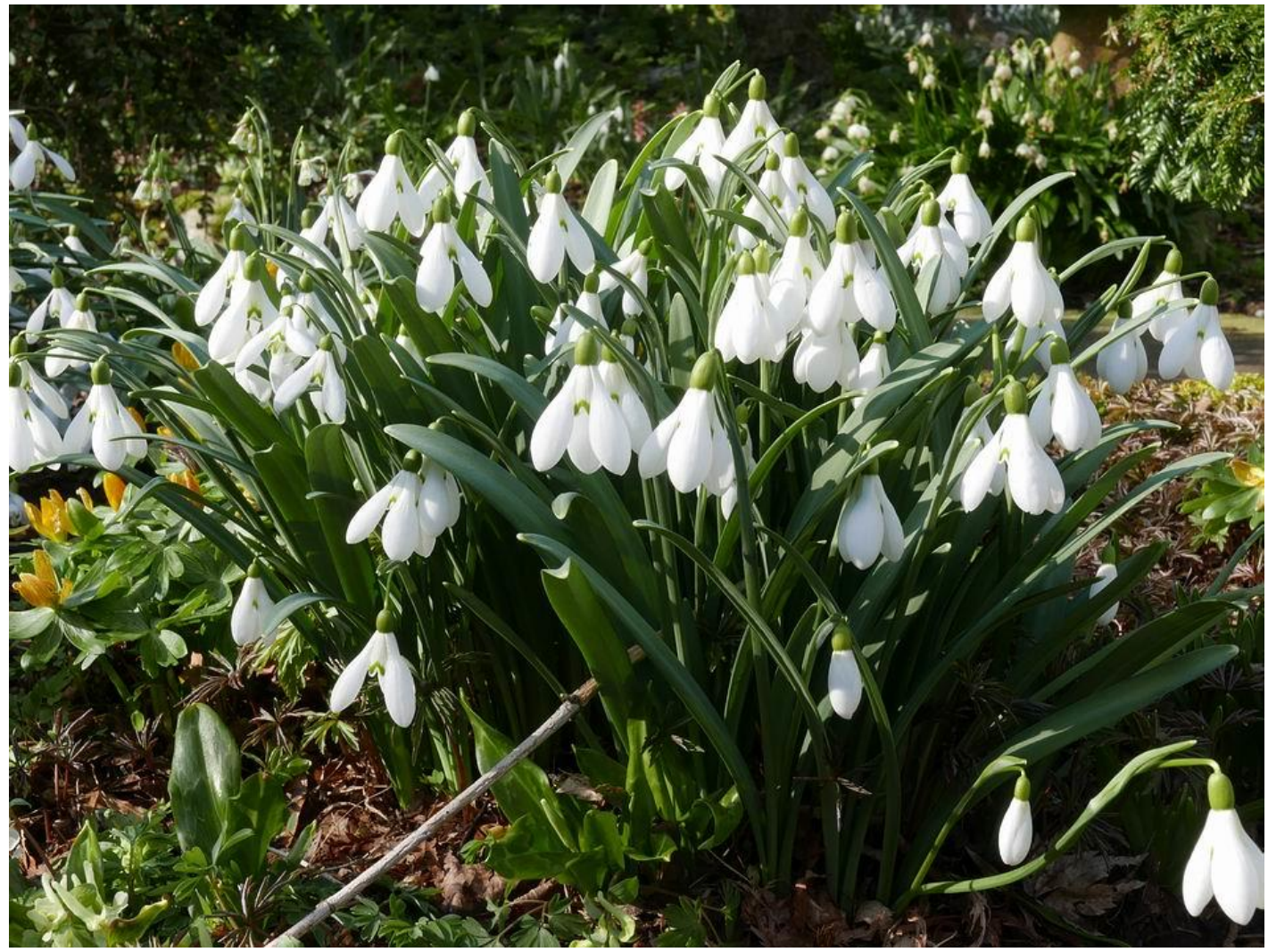
Snowdrops in their prime